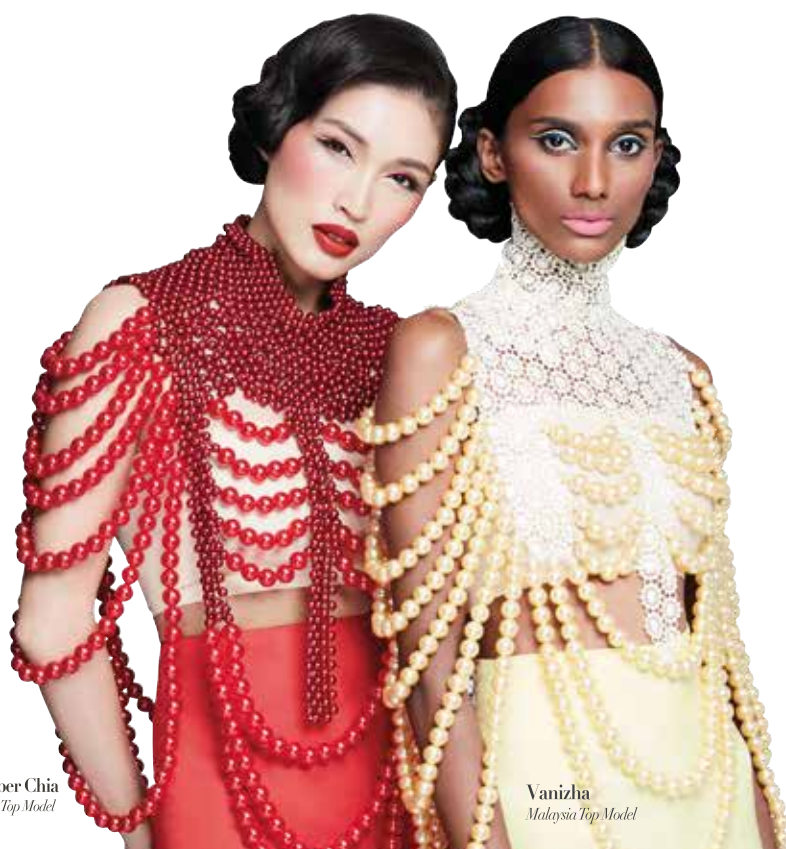
Amber Chia Malaysia Top Model