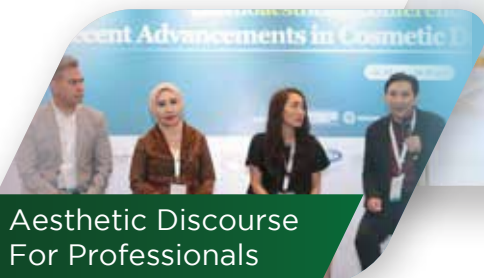
Aesthetic Discourse For Professionals